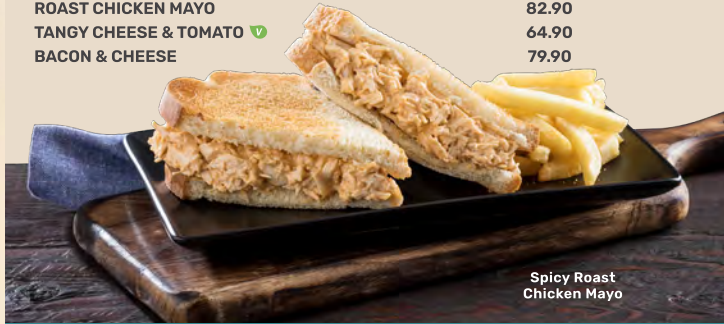
Spicy Roast Chicken Mayo