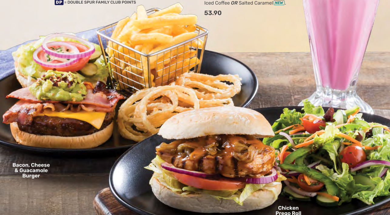
Bacon, Cheese & Guacamole Burger